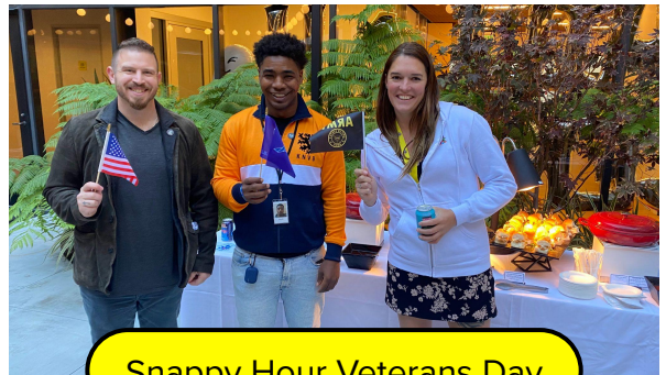
Snappy Hour Veterans Day